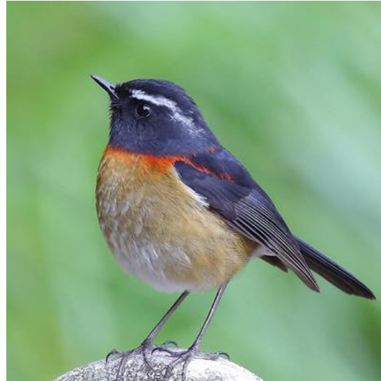
Collared Bush Robin