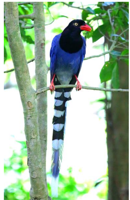
Taiwan Blue Magpie

In the morning we will visit one to two birding sites in Yangmingshan National Park, such as Qianshan Park and Menghua Lake. Qianshan Park is found in the middle area of the Yangmingshan National Park that features a variety of lakes and lush forests. During our visit, we will have good opportunities to view a variety of urban bird species such as Taiwan Blue Magpie, Taiwan Barbet, Taiwan Whistling Thrush, Malayan Night Heron, etc. Taiwan Blue Magpie is the target species we have to find here, as it is quite difficult out of the Taipei region. Menghua Lake is on the other side of Yangmingshan which is a good place to look for the difficult Taiwan Bamboo Partridge, especially in good weather conditions.